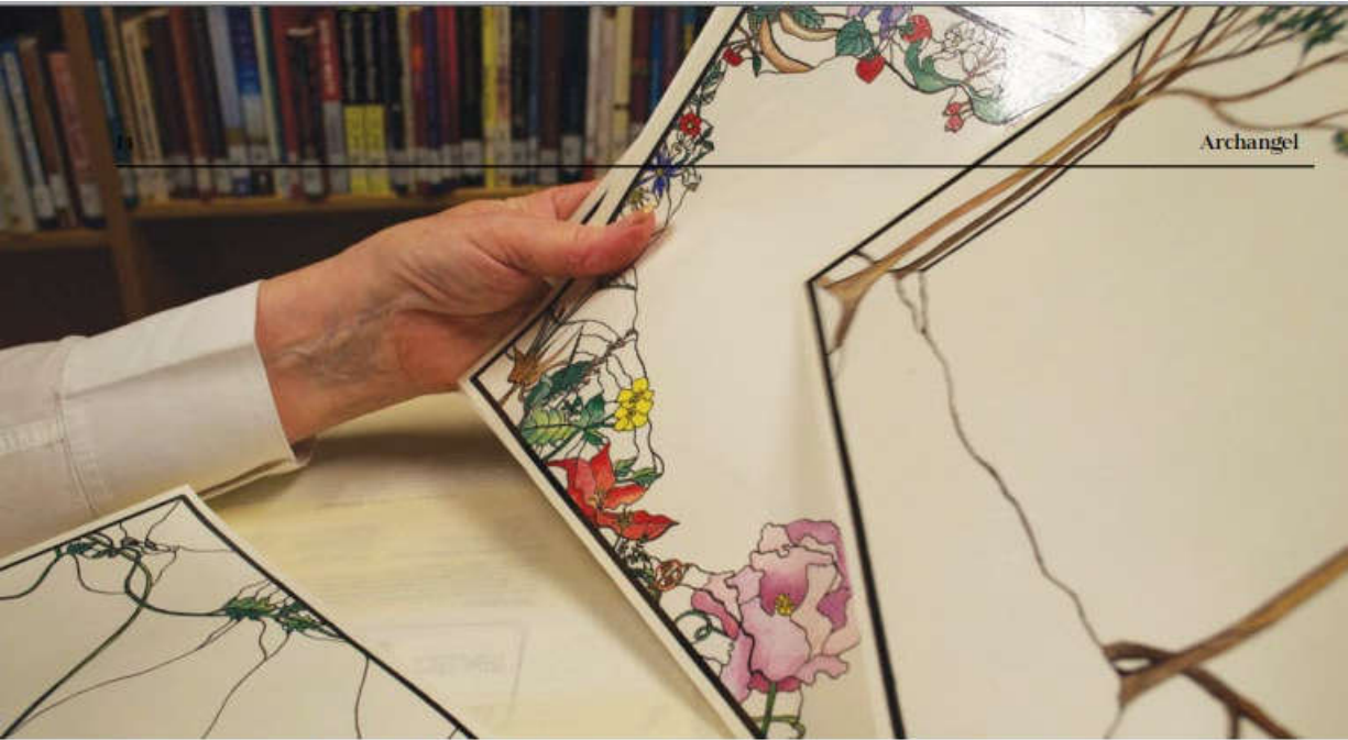
Artist Pat Stumpf, with the many renditions of the Chapel window, created during the design process.